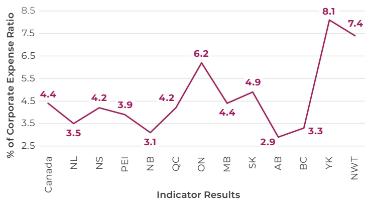
Figure 3. Corporate Services Expense Ratio in the 10 Provinces