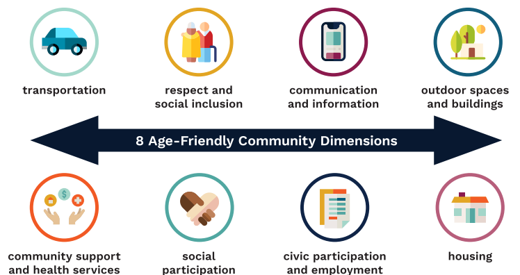
Figure 3. The Eight Domains of Age-Friendly Communities (Adapted from the World Health Organization)